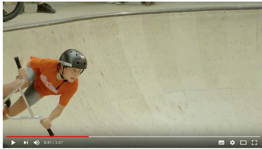
SWYG - Street Sports, Mount Hawke Event 2017